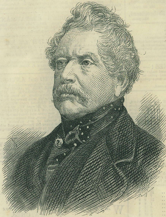
THE LATE EARL OF DALHOUSIE.

wall. This wall is a thick mass of masonry, about 22 ft. high, running straight down the side of the rock; and it proved of the utmost value, for the fire burnt up to the foot of it very fiercely, but never passed it. By midnight the whole fire died out, and the soldiers returned to their barracks. Our Illustration shows the burning rock as seen from the Spanish fishing-village called "Range Grove," at the head of the Bay of Gibraltar. At one time the fire was very serious; and fears were entertained that it might spread as far to the northward as Flat Bastion Magazine, where are stored immense quantities of powder. Great exertions were made to protect this magazine. The roof was covered with wet blankets, and a constant stream of water thrown over the whole. Fortunately, no accidents or casualties occurred; but